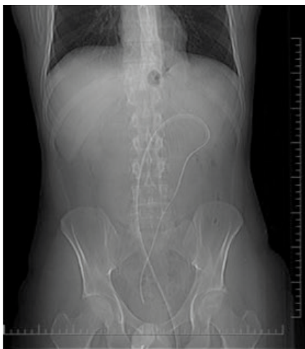
Fig. 1. Plain abdominal radiograph.

S Afr J Rad 2012;16(4):152. DOI:10.7196/SAJR.795