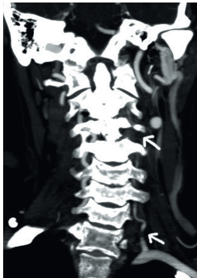
Fig. 2. Coronal MIP of a CTA of the vertebral arteries. The fracture involves the left transverse process of C3. There is diffuse spasm of the left vertebral artery with associated complete occlusion of the artery at C7 and at C3 - C4 on the left (arrows).