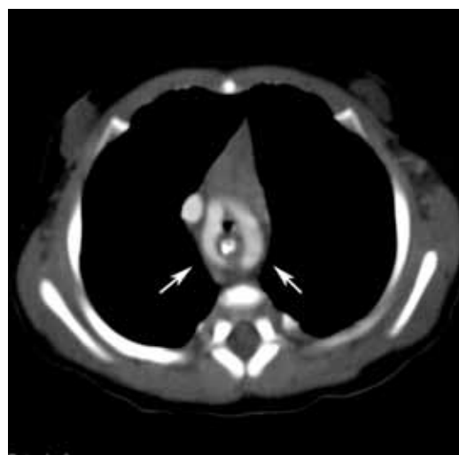
Fig. 1. Note the vascular ring (arrowed).

The computed tomography angiogram (CTA) confirms presence of a vascular ring (Fig. 1) compressing the trachea at the level of the thoracic inlet. On the volume-rendered reformatted images, the ring conforms to a double aortic arch with stenosis of the right aortic arch component. This may be due to an atretic segment or coarctation and is unusual for this aortic morphology. There is post-stenotic aneurysmal dilatation of the left arch component at the origin of the left subclavian artery, supposedly an aortic diverticulum (also unusual for double aortic arch). A small aneurysm is also noted from the right aortic arch component just distal to the origin of the right carotid artery. The compressive effect on the trachea is well-demonstrated on the 3-D maximum intensity projection (MIP) virtual bronchoscopy image with remarkable attenuation of the lumen over a long segment, up to just above the carina. The abdominal aorta shown on the abdominal CTA coronal image is of very small calibre. This is probably due to an underlying vasculopathy. Agenesis of the left kidney is also noted incidentally; this should raise suspicion for