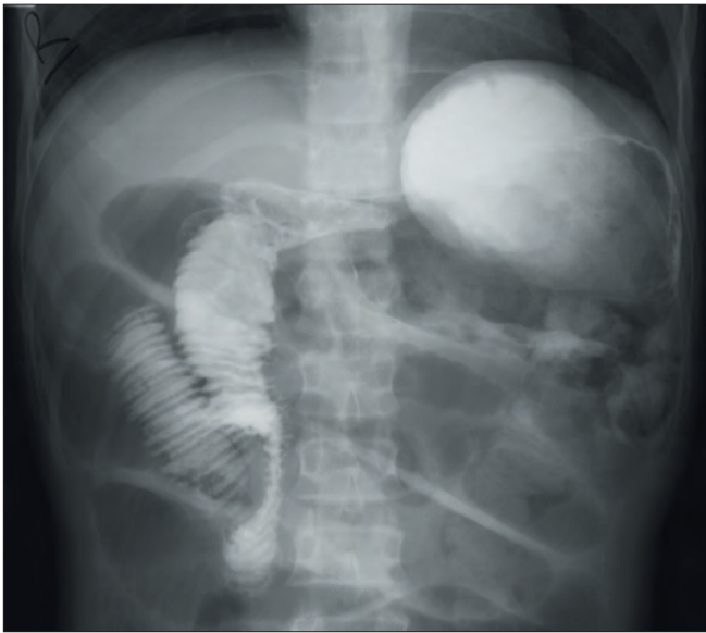
Fig. 2. Iodine contrast meal and follow-through demonstrates malrotation and volvulus of the proximal small bowel with dilation of the proximal duodenum with a 'stacked coin' mucosal pattern, possibly owing to ischaemia.