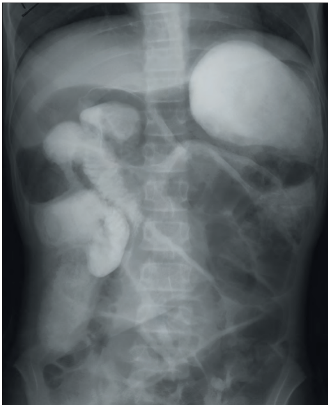
Fig. 3. Iodine contrast meal and follow-through (delayed images). A collection of small-bowel loops is noted in the right hypochondrium.