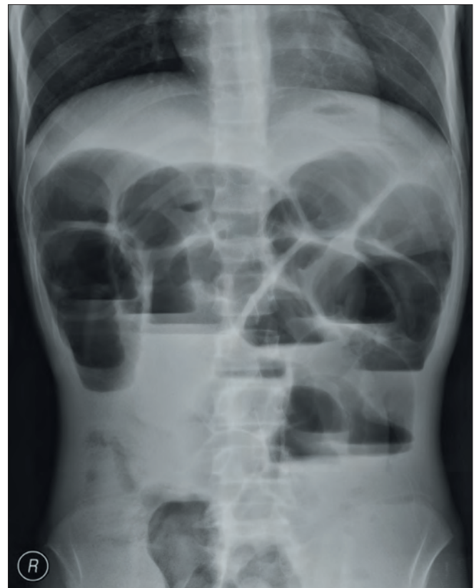
Fig. 1. Erect abdominal radiograph demonstrates dilated proximal small-bowel loops with multiple dynamic air-fluid levels in keeping with proximal small-bowel obstruction.

done well and has had no further recurrence or further symptoms or complications.